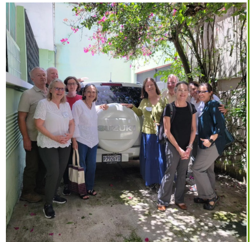
Our Guatemala travel group with the SUV

First, while visiting CEDEPCA's offices on the first full day, we took time to take a group picture by the sports utility vehicle that was purchased with a donation from our most recent capital campaign. One of CEDEPCA's programs is disaster assistance and risk assessment. After storms around the country, CEDEPCA staff were able to use the SUV to gain access to hard-to-reach communities, bringing aid, supplies, and support. This vehicle is being used today to help connect communities with the programs and resources of CEDEPCA.