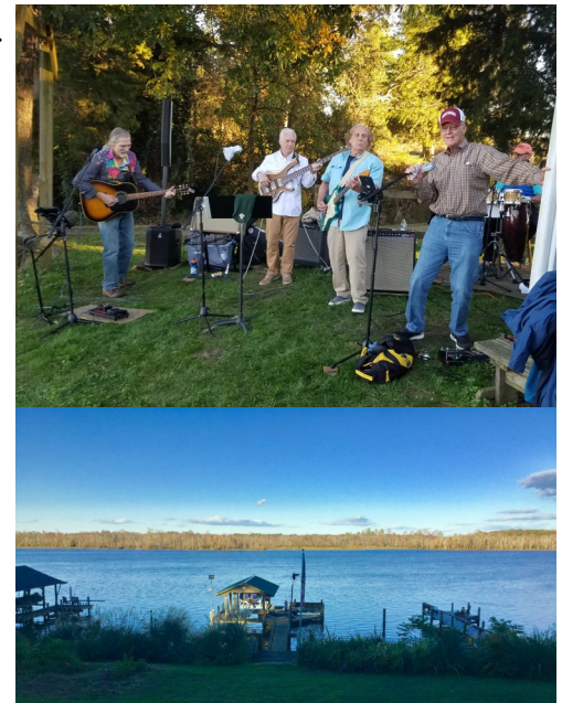
Fun times at the Oyster Roast!